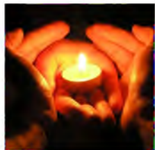
Light a Candle Enciende una vela