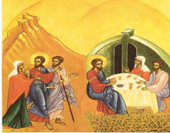
Retiro de Mujeres

"Ven peregrina conmigo... en el camino de Emaús"